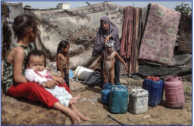
Palestinian mother washes her daughters outside during power outage in a refugee camp near Khan Younis, Gaza.