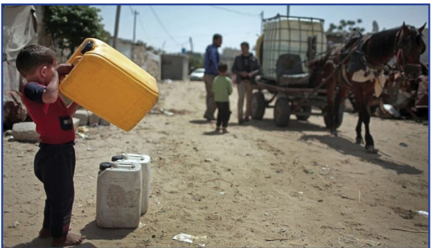
Purchasing water from a private vendor, an expensive burden on the poor majority.

These Gaza-built systems also benefit the children's families as the children bring water home from their schools.